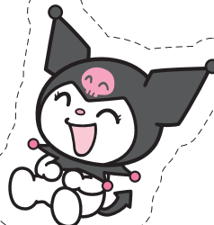
Kuromi © '05, '10 SANRIO