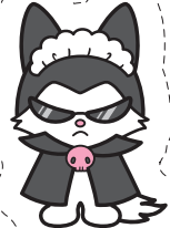
Konmi © '05, '10 SANRIO