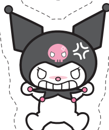
Kuromi © '05, '10 SANRIO