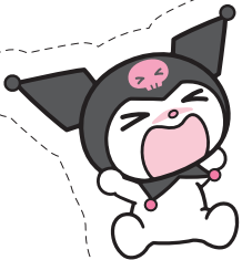
Kuromi © '05, '10 SANRIO