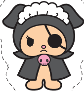
Wanmi © '05, '10 SANRIO