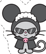
Chumi © '05, '10 SANRIO