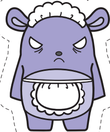
Baku © '05, '10 SANRIO