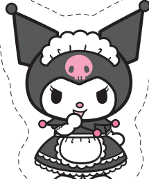
Kuromi © '05, '10 SANRIO