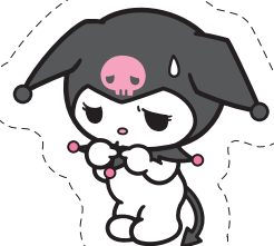
Kuromi © '05, '10 SANRIO