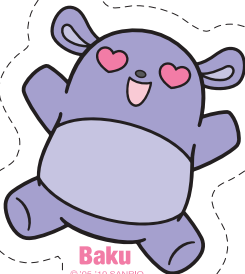
Baku © '05, '10 SANRIO