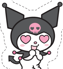
Kuromi © '05, '10 SANRIO