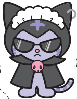
Nyanmi © '05, '10 SANRIO