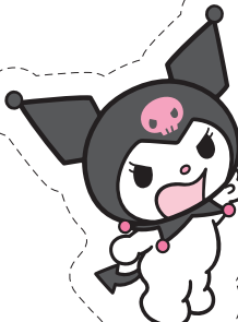
Kuromi © '05, '10 SANRIO